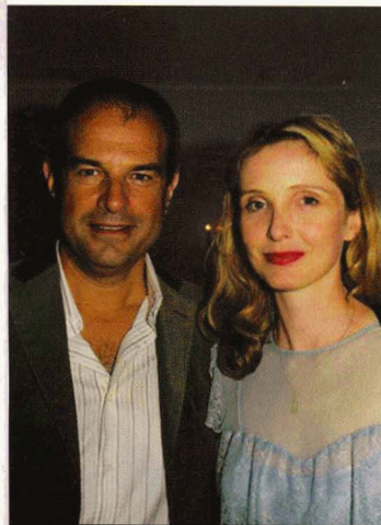
Massimo Ferragamo and Julie Delpy